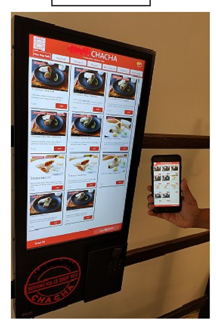
Floor mount model